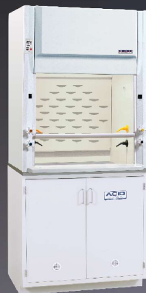
UniFlow CE AirStream