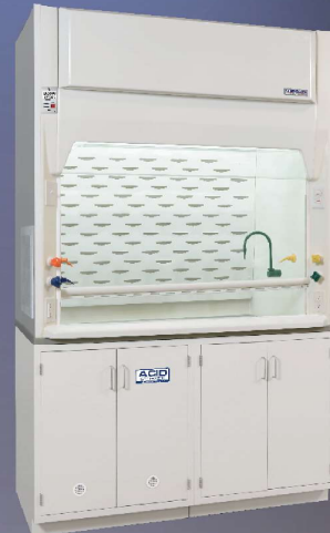
UniFlow SE AirStream High Performance Energy Efficient Laboratory Fume Hoods