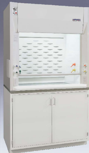
UniFlow LE AirStream